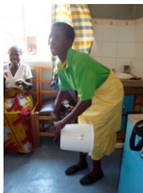
Drumming on a pail at the Library dedication.